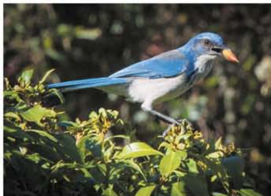
A scrub jay with an acorn in Paradise Park.